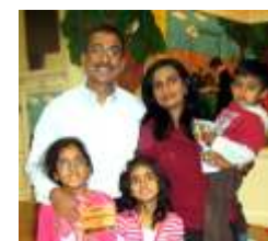
Two winners from 2009

www.newtoncivicpride.org Grades K-3 - Choose one: Monday, March 1 or Wednesday March 3 Grades 4-6 - Choose one: Monday, March 8 or Wednesday, March 10 In conjunction with Mount Ida College